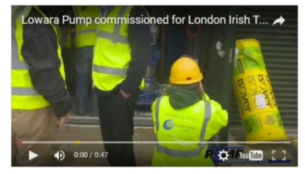
Click on the Picture to watch the Video

Supplying equipment this way ensures that it is fully functional, minimises installation time and ensures that the timing always matches the site work schedule.