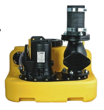
Above Ground Sewage Pumping Stations

Call the Pump Technology Application Team, we will be please to help you Tel 0118 9821555.