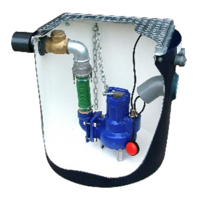
Below Ground Sewage Pumping Stations