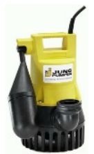
Small Drainage Pumps