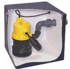
Basic Waste Water Pumping Stations