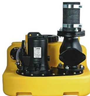
Above Ground Sewage Pumping Stations