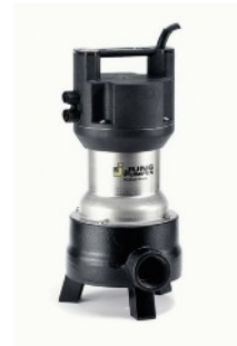
High Temperature Pumps