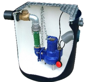
Below Ground Sewage Pumping Stations

Call the Pump Technology Application Team, we will be please to help you Tel 0118 9821555.