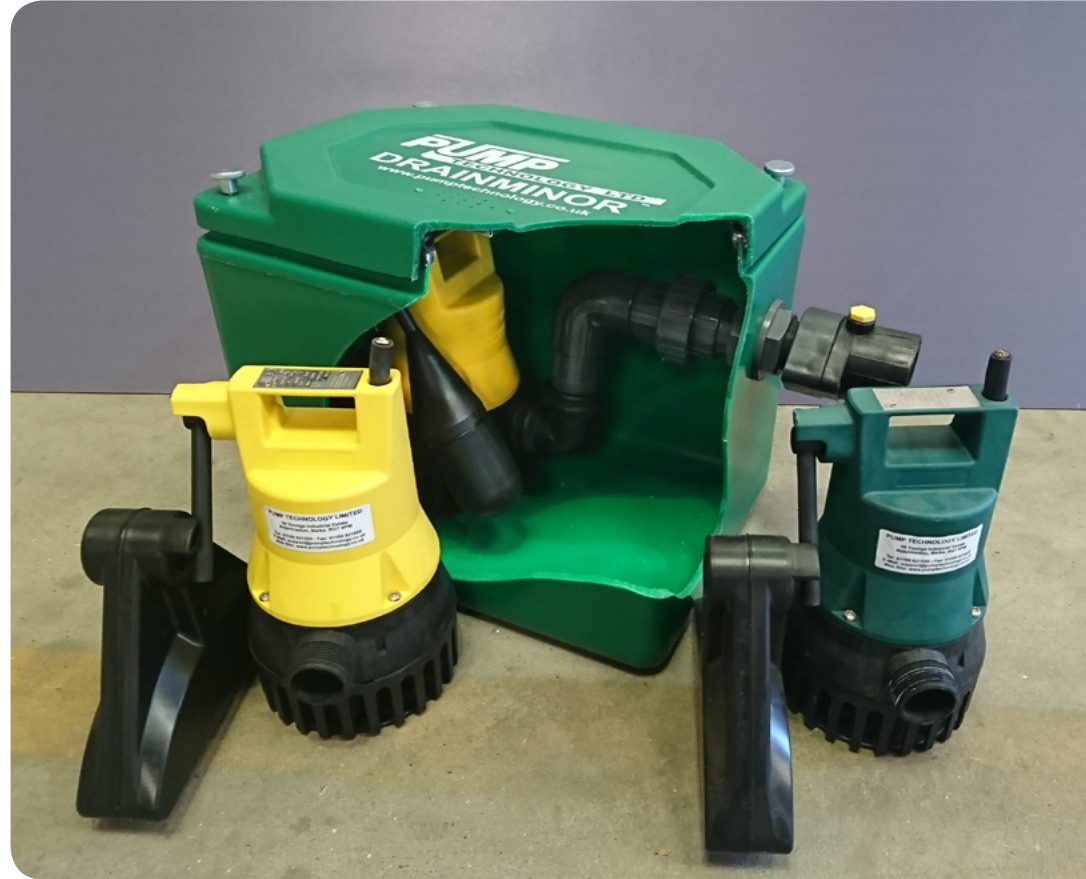
A cutaway of the new Pump Technology Ltd. DrainMinor, floor mounted, wastewater pumping system