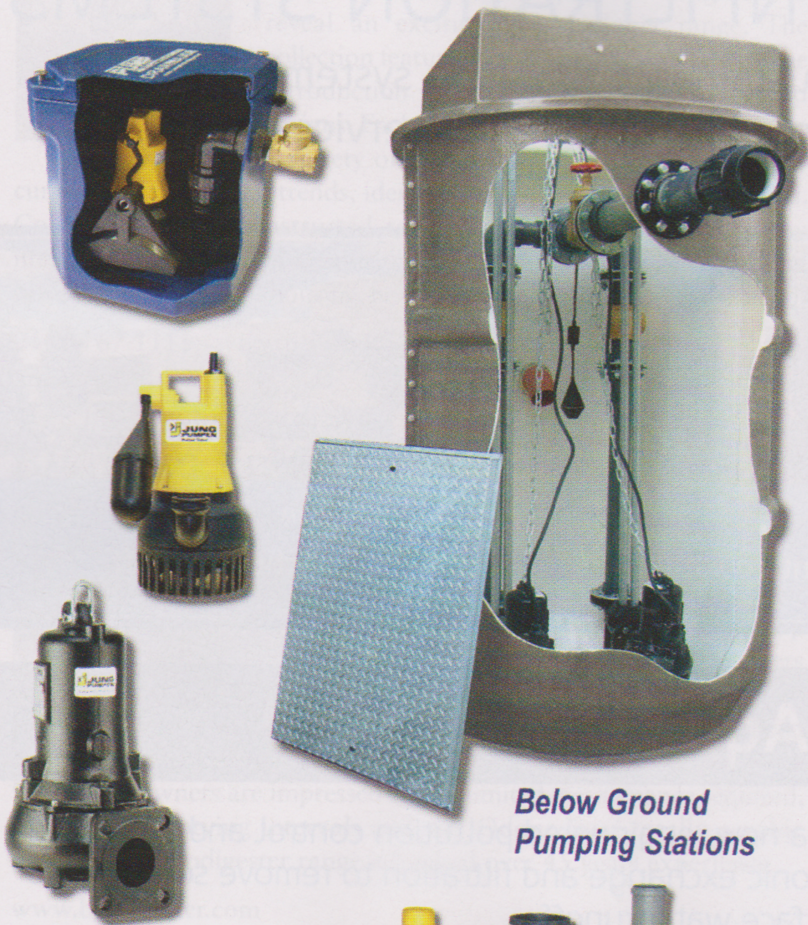
Below Ground Pumping Stations