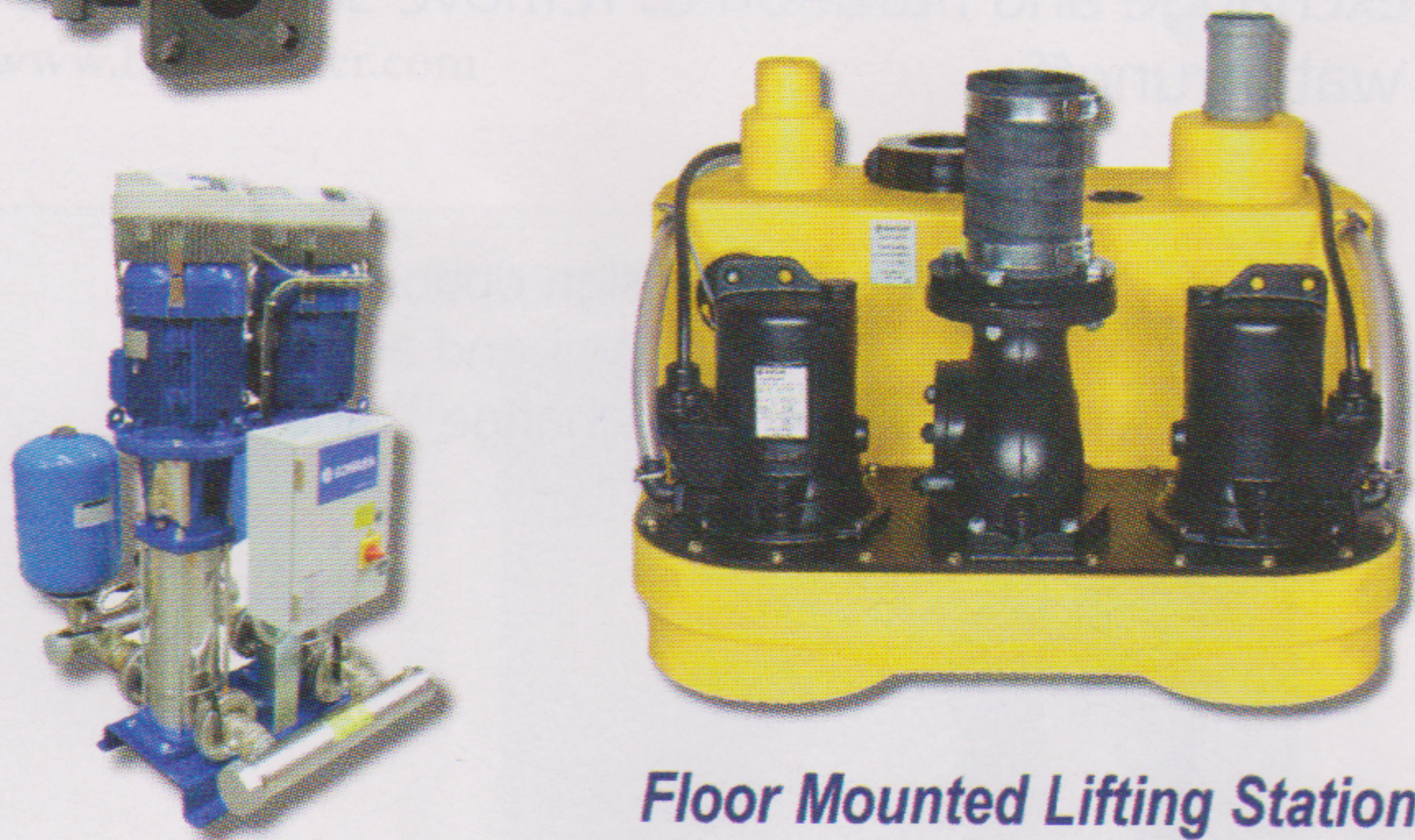
Floor Mounted Lifting Stations