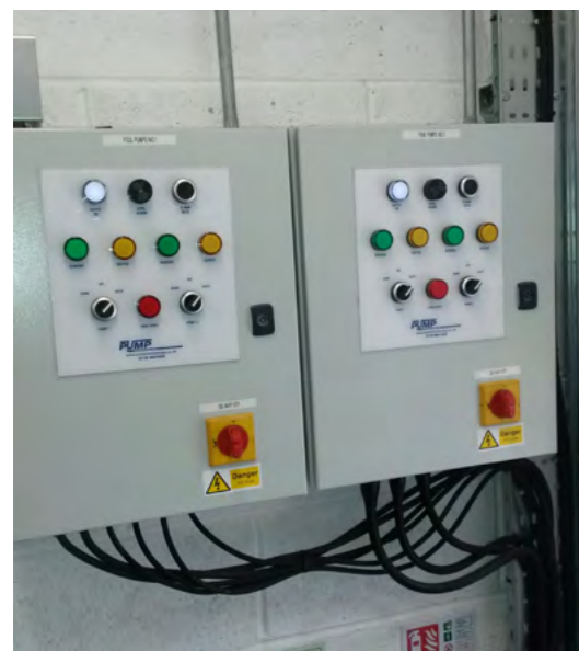
Twin Control Panel System

The customer is now on a 6-month Pump Technology Ltd.™ servicing program with cleaning of the tanks via a tanker to be completed every 18-24 months.