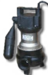
730 HES Hot water