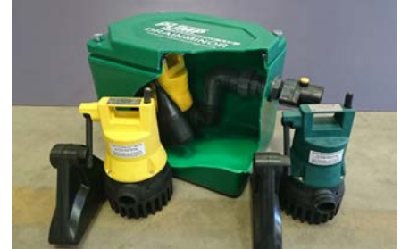
A cutaway of the new Pump Technology Ltd. DrainMinor, floor mounted, wastewater pumping system

The new unit with appropriate pump options, High Level Alarm and FlowSafe to turn off incoming water feed to appliances such as dish and washing machines, is available from stock. It can be purchased direct or via local merchants.