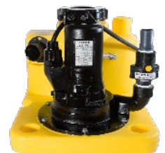
EffluMaxi Grinder Single