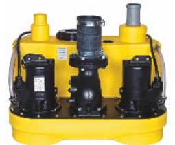
EffluMaxi 80 Twin