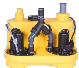
EffluMaxi Grinder Twin

If you want a resilient floor mounted sewage lifting station that will handle multiple toilets in busy commercial premises like casual dining outlets to night clubs ask for the EffluMaxi range. It's proven!