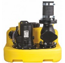
EffluMaxi 80 Single