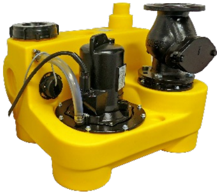
EffluMaxi 80 Single / Compli 300 / 400