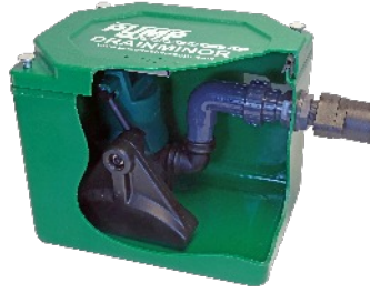
DrainMinor S (Shower tray Pump)