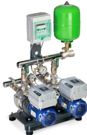
Twin Booster Set