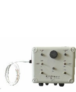
High Level Alarms