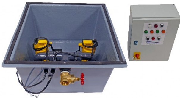
DrainKing (Duty / Standby)

DrainMinor/DrainMajor Range Tanks Recyclable