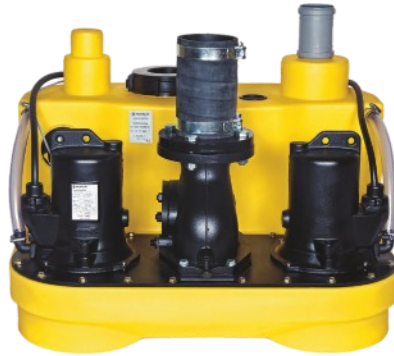
EffluMaxi 80 Twin / Compli 1000 / 1200