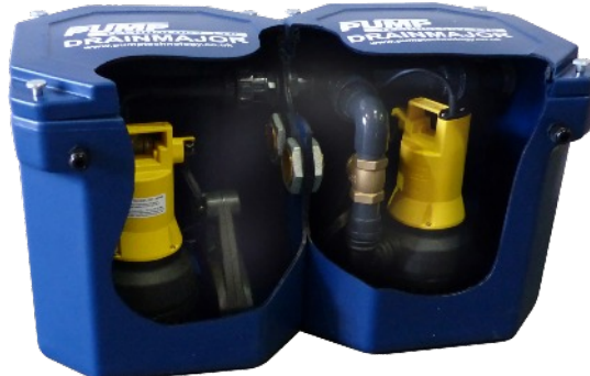
DrainMajor Duo (Duty / Standby)