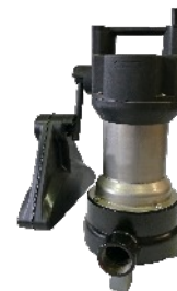
(Hot Water Pump Option 90°C continuously rated)