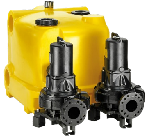
EffluMaxi 150 Twin / Compli 1500 /2500 (Large tank storage)