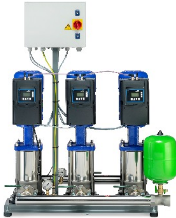
Triple Booster Set