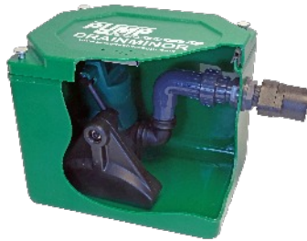
DrainMinor SL (Special for light chemical options)