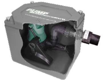
DrainMinor C (Combi Oven Pump)