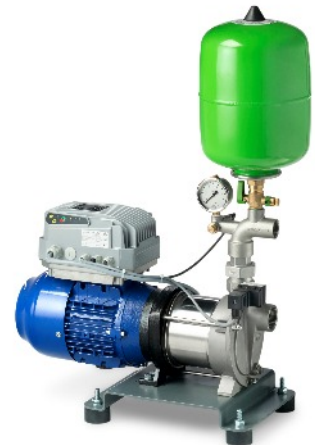
Single Booster Set