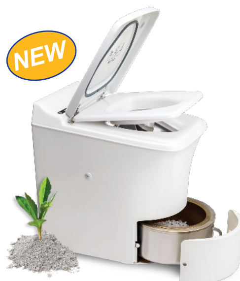
Cinderella (Incineration Toilet)