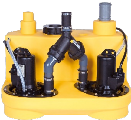
EffluGrinder / Compli Multicut (Cutter)